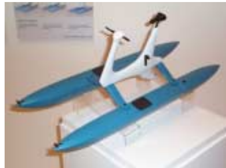
Exhibit from the 2001 Carleton Grad Show