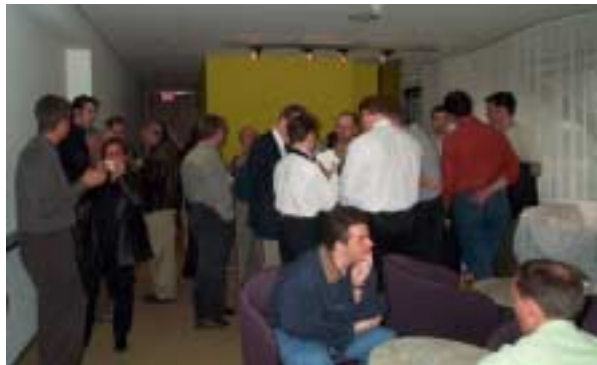
Socializing at the 2001 ACIDO AGM