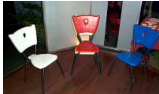
Winning design at the 2001 Humber Chair Show