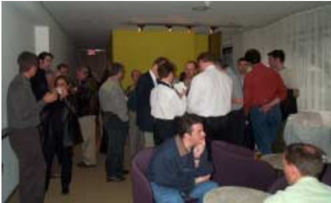
< Members had a chance to socialize before the AGM.